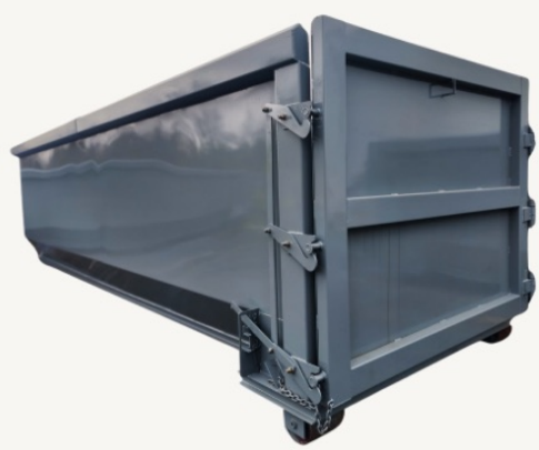
Vertical Lift Latch