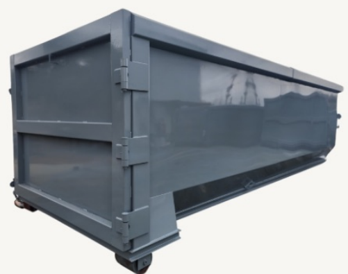
HD Hinges, Door & Wheels