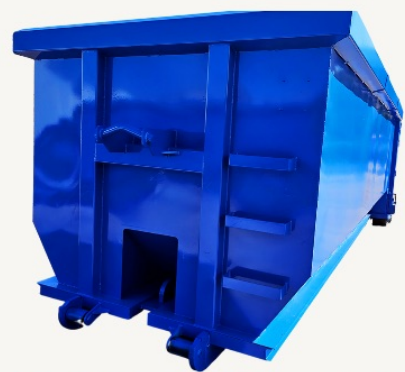
HD Uprights & Nose Rollers